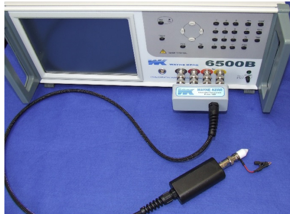
1J1025 Probe ready for use