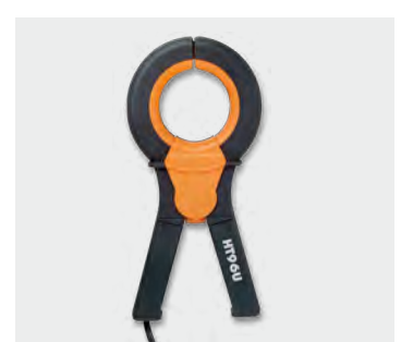
HT96U AC leakage current clamp (optional)