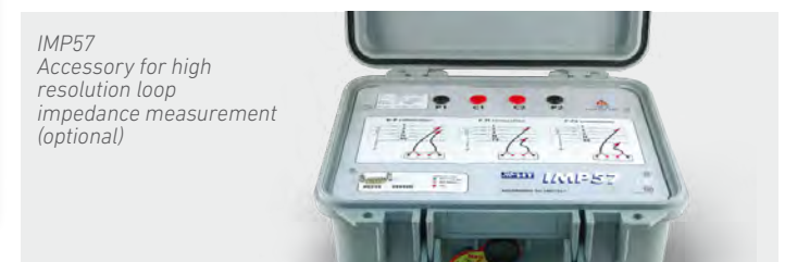
IMP57 Accessory for high resolution loop impedance measurement (optional)