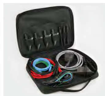
Carrying case for accessories (standard)